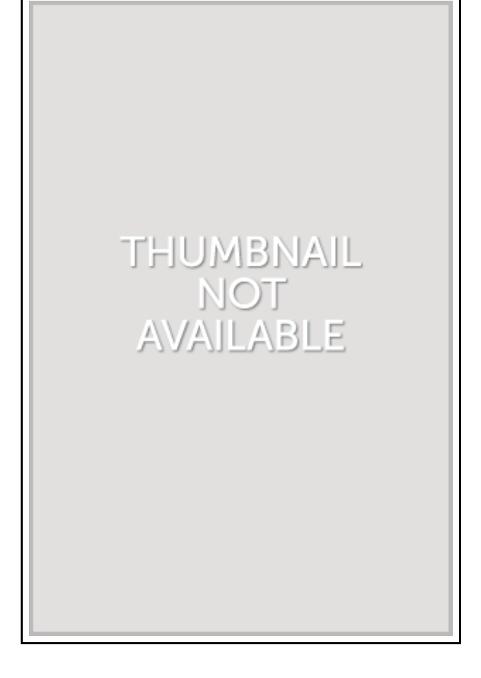
Filesize: 7 MB